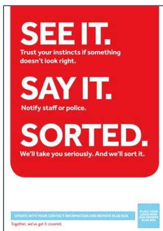
Non Critical poster

We have produced a simple poster and audio/tannoy announcements that you can download and record for use at your site/public place. These are based on the existing rail campaign.